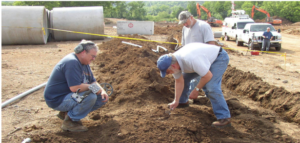
Archeologists searching Remains

On 14 May 2009, a construction worker unearthed human bones located in a shallow grave. The police were called, and upon their examining the bones and the buttons accompanying them, it was determined that this was the remains of a Civil War soldier.