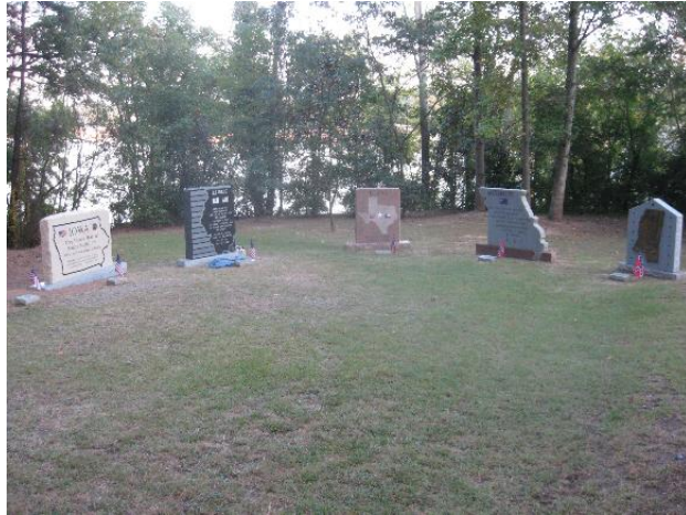
Allatoona Pass Today

October 5th, and entreat any loyal sons of the Badger State to step up to the plate and honor their state, and the heroes that fell there so long ago, with a tax-deductable donation.