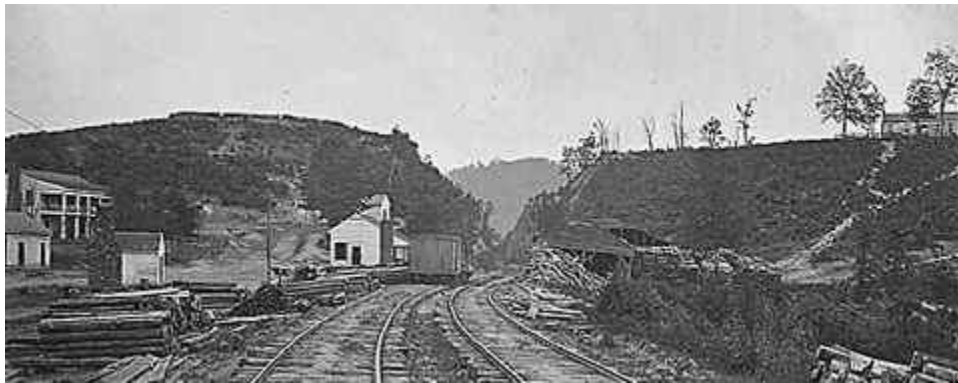
Allatoona Pass shortly after the 1864 Battle

Thanks to the dedication and generosity of SUVCW members Illinois and Iowa dedicated their monuments in 2008, followed by Minnesota in 2010. This October 5th, at 11AM we will dedicate the Ohio monument, which leaves only Wisconsin unfinished. Five Confederate states have put up monuments, with only one remaining to be erected. We hope to have Wisconsin in place by the sesquicentennial anniversary of the battle, October 5th, 2014.