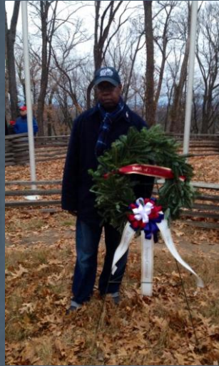
150 th Battle of Shy's Hill