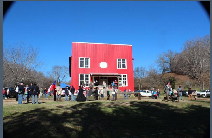
The Famous "Big Red Store" in Appleton, Tennessee was the site of the Commemoration

On December 5th, 2015, the 10th Regiment, Tennessee U.S. Vols participated in the commemoration of the last Civil War engagements in Tennessee. General James Wilson's cavalry was pursuing the remnants of General Hood's CS Army of Tennessee in far southern Middle Tennessee after the Battle of Nashville.