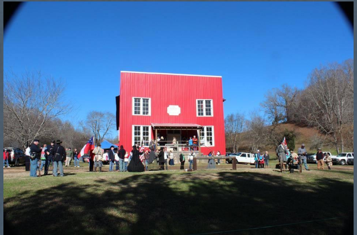
The Famous "Big Red Store" in Appleton, Tennessee was the site of the Commemoration

On December 5th, 2015, the 10th Regiment, Tennessee U.S. Vols participated in the commemoration of the last Civil War engagements in Tennessee. General James Wilson's cavalry was pursuing the remnants of General Hood's CS Army of Tennessee in far southern Middle Tennessee after the Battle of Nashville.