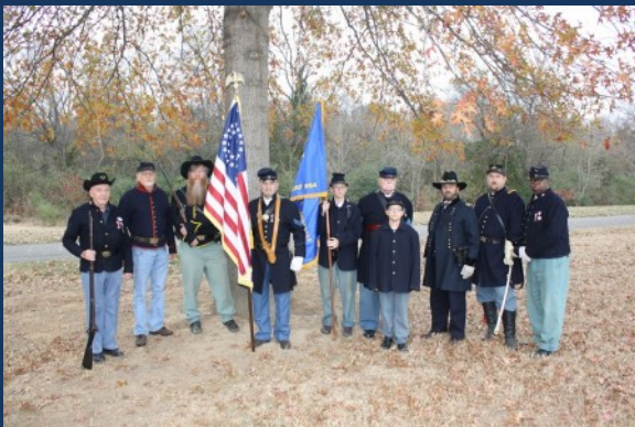
Members of the 10th Tennessee, U.S. Volunteers, SVR, and friends