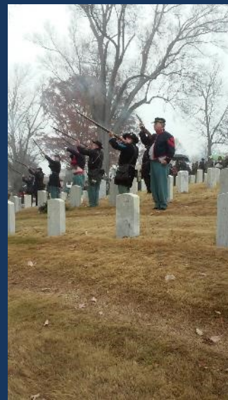
An Honor Guard of mixed units, SVR & Re-enacting companies ready to fire