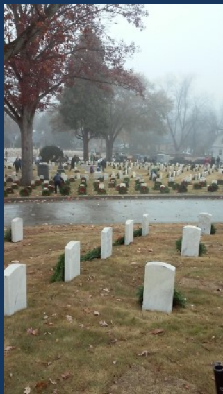
The Boy Scouts did a great job of very quickly placing the 10,000 wreaths at the cemetery.